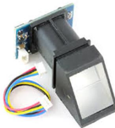
FIGURE 1 FINGERPRINT SENSOR

stored on the memory of the controller using various algorithms. Internally, it just converts it pieces of code which the microcontroller stores it in its memory and verifies it. Along with the fingerprint sensor three buttons are also used among which one of them is used for sensing the fingerprints. The other two are used whenever a fingerprint is too added or deleted. It scans the edges of the fingers and stores it in the memory of the controller. In case of deleting the fingerprint, we should first place the fingerprint that needs to be deleted, and on pressing the delete button we must scan that same fingerprint again. This deletes the fingerprint from the memory of controller.