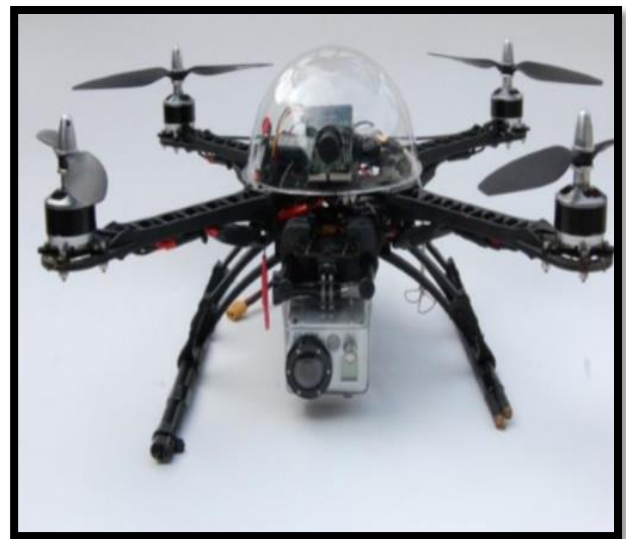
Figure 1: A Drone

usage of composite material strength allows it to cruise at extremely high altitudes. They are equipped with the infrared cameras, global positioning system (GPS), and laser or GPS guided missiles.